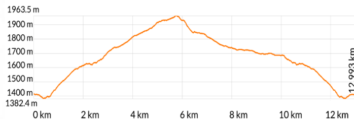
Altimetría PR-TF 72: Vilaflor - Paisaje Lunar - Vilaflor